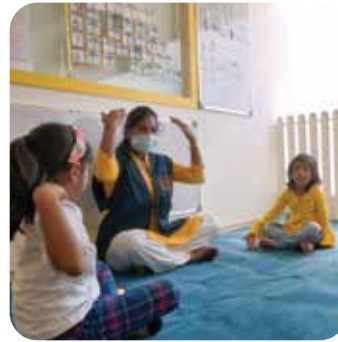
Circle Time & Concept Building