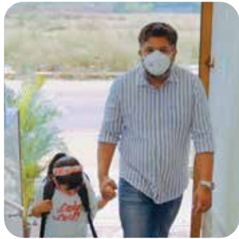
Arrival & Free Play