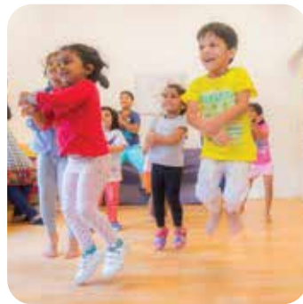
Storytime, Music & Movement, Role Play