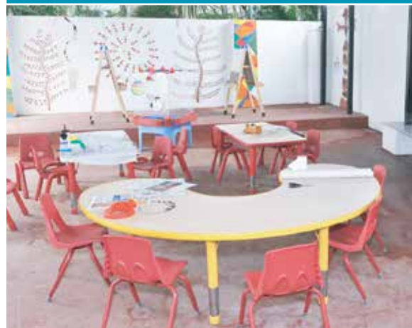
Art & Craft