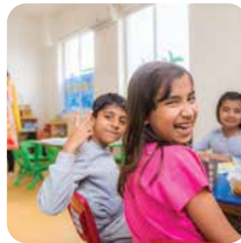
Freshen Up & Snack