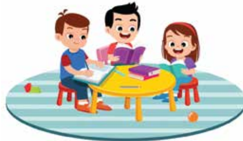
Verbally Linguistic Intelligence