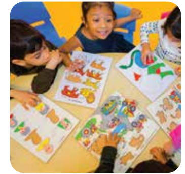
Exploring Learning Centres/ Outdoor Play