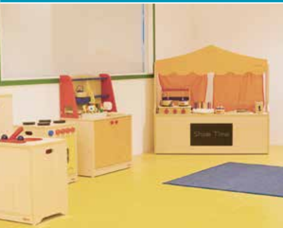
Dramatics & Role Play