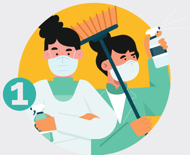
CENTRE AND STAFF HYGIENE

We follow a comprehensive three-pronged approach to H&S during the pandemic, covering